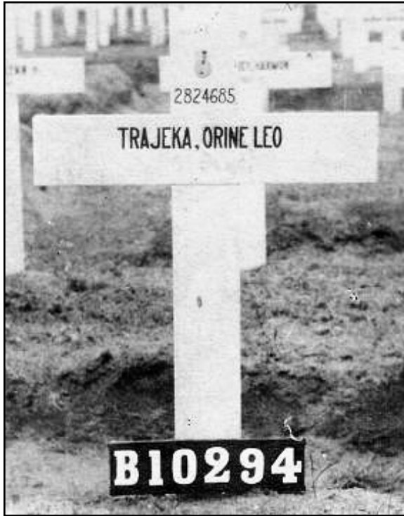
Left: wooden marker Orine Trafka at Cemetery 1252.